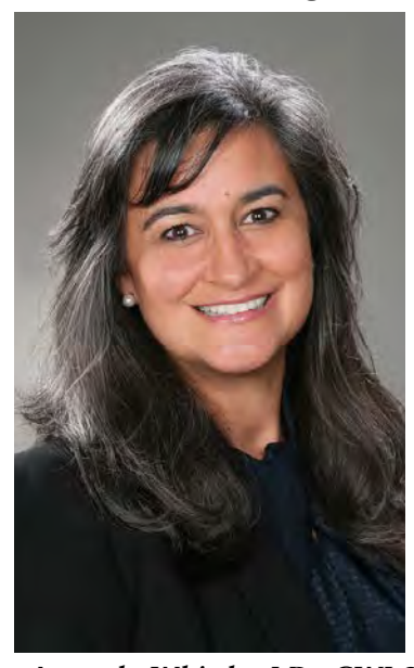
State Child Advocate and Director abuse.

It is my pleasure to share April 2022 highlights with you.